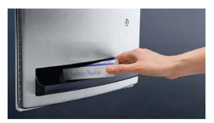
Convenient access product tray.